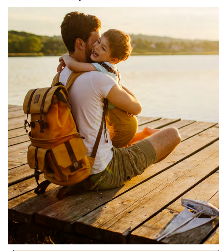
"We turned off the phones, had no distractions, and enjoyed total peace, quiet, and seclusion."