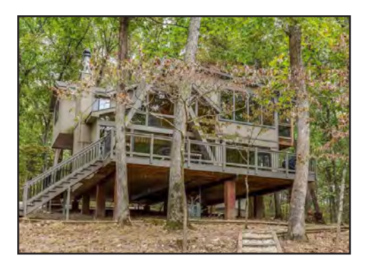
1718 SHORELINE ESCAPE CHALET

"One of my fondest memories is sitting on the deck watching the sun rise on a beautiful fall morning. We can't wait to return!"