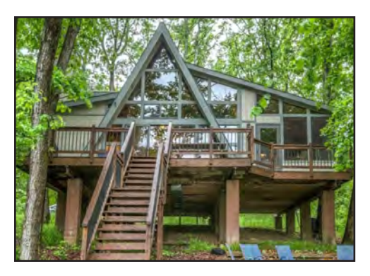
1717 LAKESIDE CHALET