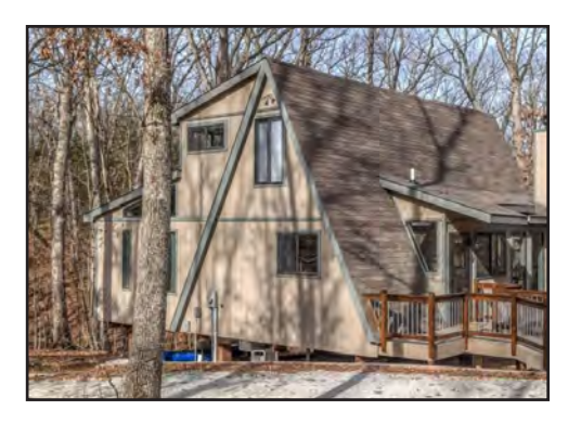
1716 TREETOP GETAWAY CHALET