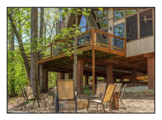
1760 WATERSIDE COTTAGE